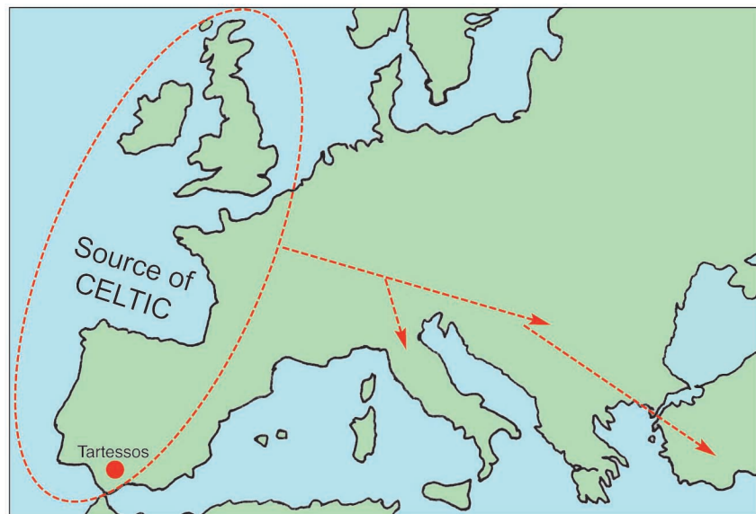
The new view of how Europe became Celticised. The earliest attested Celtic script is from the ancient kingdom of Tartessos c.7th century BC.