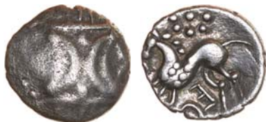
23. Ecen Retro. 13mm. 1.23g. ABC 1669. VF/Good VF, lovely horse, clear EC. £175