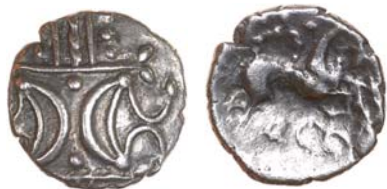
21. Ecen Six. 12-14mm. 1.15g. ABC 1663. Good VF/Nr VF, bold moons, clear torcs. £175