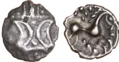
18. Ecen Corn Ear. 13mm. 1.14g. ABC 1657. VF/Good VF, bold strike, horse centred. £175