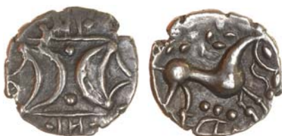
17. Ecen Corn Ear. 13mm. 1.28g. ABC 1657. Good VF, bold strike, sharp letters £200