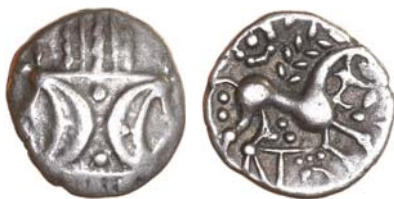
11. Antedios D-Bar. 13mm. 1.22g. ABC 1645. Good VF, well ornamented, corn ear mane. £225