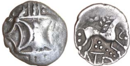
14. Antedios D-Bar. 14mm. 1.05g. ABC 1645. VF/Good VF, bold trefoil. £175