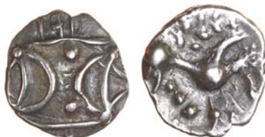
16. Ecen Corn Ear. 13mm. 1.21g. ABC 1657. Good VF, bold strike. £200