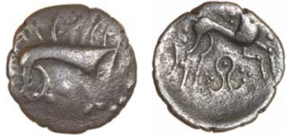
8. Norfolk Boar Phallic. 13mm. 1.13g. ABC 1582. VF, bold boar, clear phallic symbol. £175