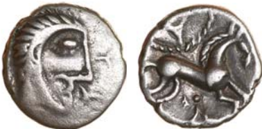
5. Norfolk God. Moustache Type. 13mm. 1.29g. ABC 1567. VF/Good VF, bold horse. £225