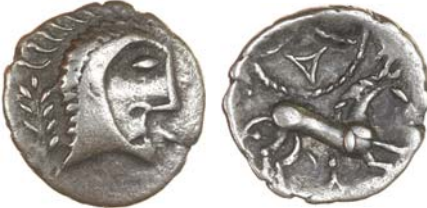
4. Norfolk God. Moustache Type. 14mm. 1.21g. ABC 1567. Good VF, full 'kite' and corn ear. £250