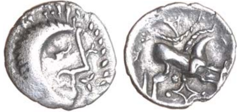
6. Norfolk God. Moustache Type. 15mm. 1.21g. ABC 1567. VF/Good VF, big flan. £225