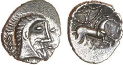
3. Norfolk God. Moustache Type. 12-14mm. 1.27g. ABC 1567. Good VF, sharp head. £250