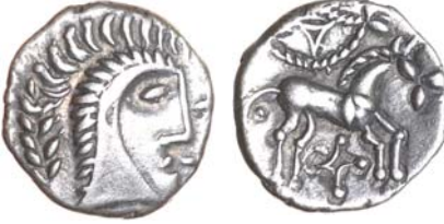
2. Norfolk God. Moustache Type. 13mm. 1.21g. ABC 1567. Near EF, lovely head. £260