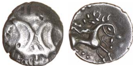
13. Antedios D-Bar. 14mm. 1.22g. ABC 1645. VF/Good VF, whole horse's head. £175