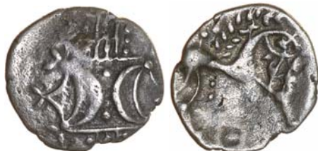
15. Antedios D-Bar. 14-16mm. 1.15g. ABC 1645. Good VF/VF, clear corn ear. £175