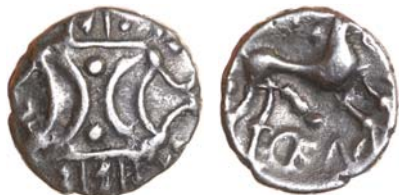
24. Ecen Edn. 13mm. 1.20g. ABC 1672. Good VF, bold moons, complete ECEN. £200