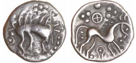
7. Norfolk Boar Phallic. 14mm. 1.11g. ABC 1582. Good VF/Near EF, well ornamented. £250