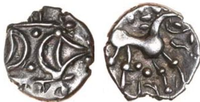
26. Ecen Ed. 12mm. 1.29g. ABC 1675. Good VF, bold strike, clear ED £175