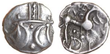
27. Ecen Ed. 13mm. 1.16g. ABC 1675. Good VF, big D, fully displayed. RARE. £200