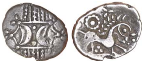
12. Antedios D-Bar. 11-15mm. 1.22g. ABC 1645. Good VF, well ornamented, corn ear mane. £225