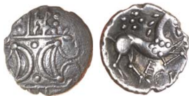
20. Ecen Six. 12mm. 1.11g. ABC 1663. Good VF, bold, handsome horse. £200

All coins guaranteed genuine or double your money back