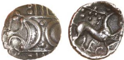
19. Ecen Six. 13mm. 1.19g. ABC 1663. Good VF, clear EC. £200