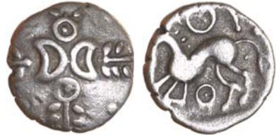
9. Crescent Corn Ears. 12mm. 1.15g. ABC 1591. Good VF, bold crescents. SCARCE. £200