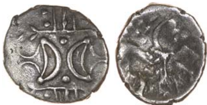
22. Ecen Six. 12mm. 1.23g. ABC 1663. Good VF/VF, bold moons, four torcs visible. £175