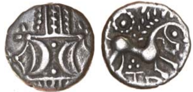
10. Antedios D-Bar. 12mm. 1.21g. ABC 1645. Good VF, sharp strike. £225

All coins guaranteed to be from the Scole Boudica Hoard 1982-83