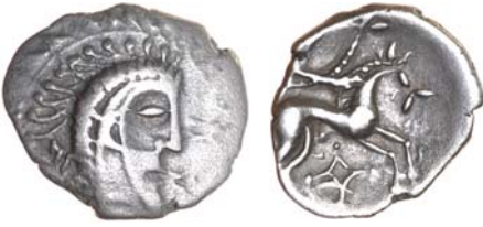
1. Norfolk God. Small Head Type. 12-14mm. 1.24g. ABC 1564. Good VF, lovely head. £250