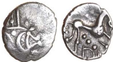
25. Ecen Edn. 13mm. 1.26g. ABC 1672. VF/Good VF, bold pellets, clear ED. £175