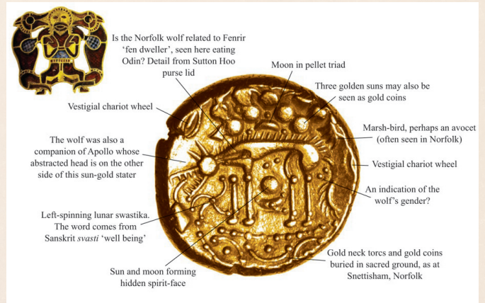
Anatomy of a Norfolk Wolf (Left Type) gold stater, ABC 1396, struck by the Iceni c. 50–40 BC, found by metdet Scott Larcombe, near Lowestoft, Suffolk, 2011. The neck torcs on Norfolk Wolf staters were copied directly from Gallic War Uniface staters.