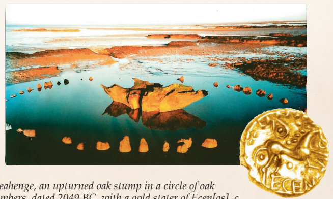
Seahenge, an upturned oak stump in a circle of oak timbers, dated 2049 BC, with a gold stater of Ecen[os], c. AD 10–43, ABC 1651. His name, which is not unlike the name of the tribe, Iceni, may mean "lord of the oaks".