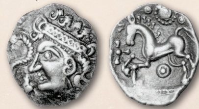
Iceni silver unit, ABC 1495, with Belgic-style snake before head, tiny snakes forming horse's mane and Belgic swastika in front of horse.