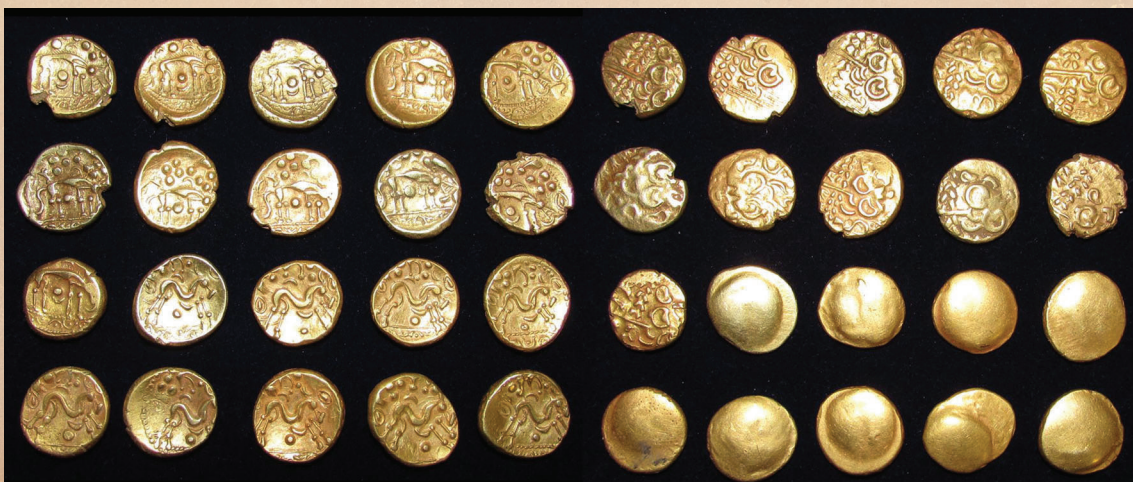
The Fakenham Hoard comprises 11 Norfolk Wolf (Right Type) gold staters, c. 55–50 BC, ABC 1393, and nine Gallic War Uniface gold staters, c. 58–51 BC, ABC 16. Like several other gold hoards, the Fakenham Hoard was buried in northwest Norfolk, which seems to have been a religious region for the Iceni since the Bronze Age.