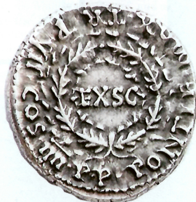
3. A Nero denarius dated AD 60-61 indicates that the Scole hoard was buried during Boudica's revolt.