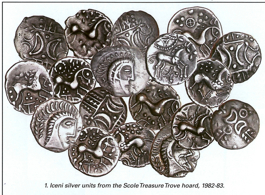
1. Icenian silver units from the Scole Treasure Trove hoard, 1982-83.